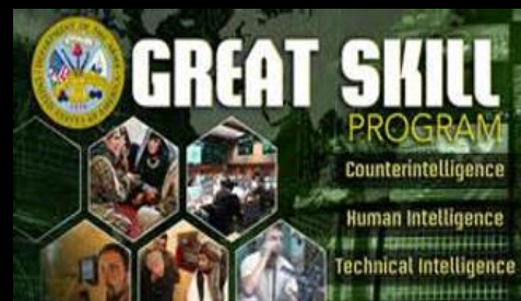
Great Skills Program