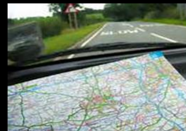
Army Operations Security Detachment